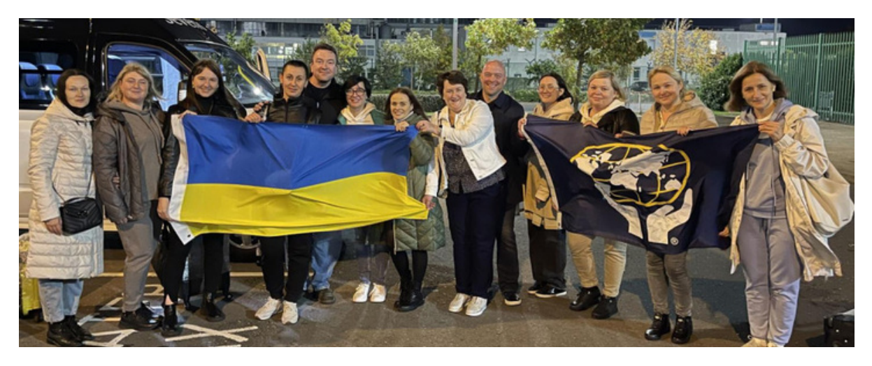
Persha Vseukrayinska Kredytna Spilka and WFCU staff land in Ireland to meet with Dundalk Credit Union as part of our Global Bridges program.

Our Global Bridges program has fostered a powerful partnership between Dundalk Credit Union in County Louth, Ireland, and Persha Vseukrayinska Kredytna Spilka (PVKS) in Kyiv, Ukraine.