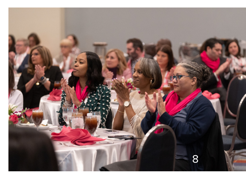
GWLN members at the GWLN Luncheon at GAC in 2023.

We also re-activated empowerment grants for scholars to implement projects aimed at growing financial inclusion, advancing social and community impact efforts, and uplifting their members and communities.