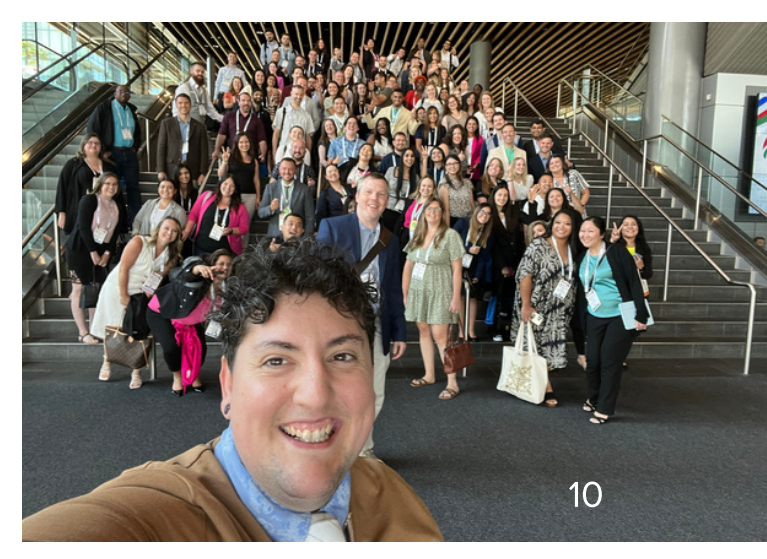
WYCUP members at the first ever in-person WYCUP summit, Vancouver, 2023.

The establishment of the Affiliates Council also broadened our capabilities to connect with leaders of young professional networks across the globe, bringing them together to discuss industry trends and promote the WYCUP experience.