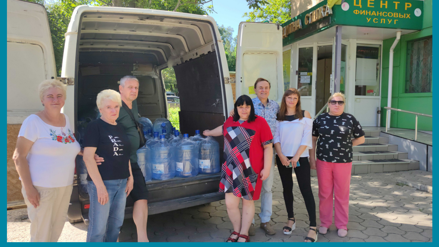
Credit union employees in the war-affected region of Ukraine, receiving drinking water thanks to a WFCU grant.