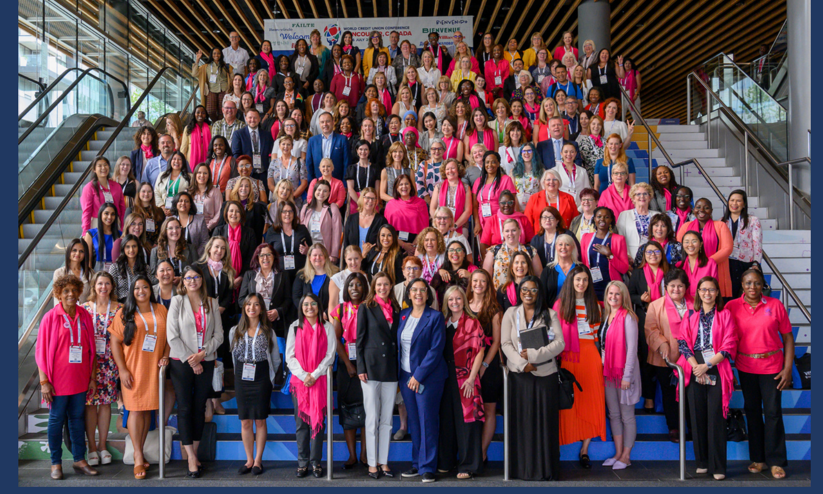
2023 GWLN Forum at WCUC