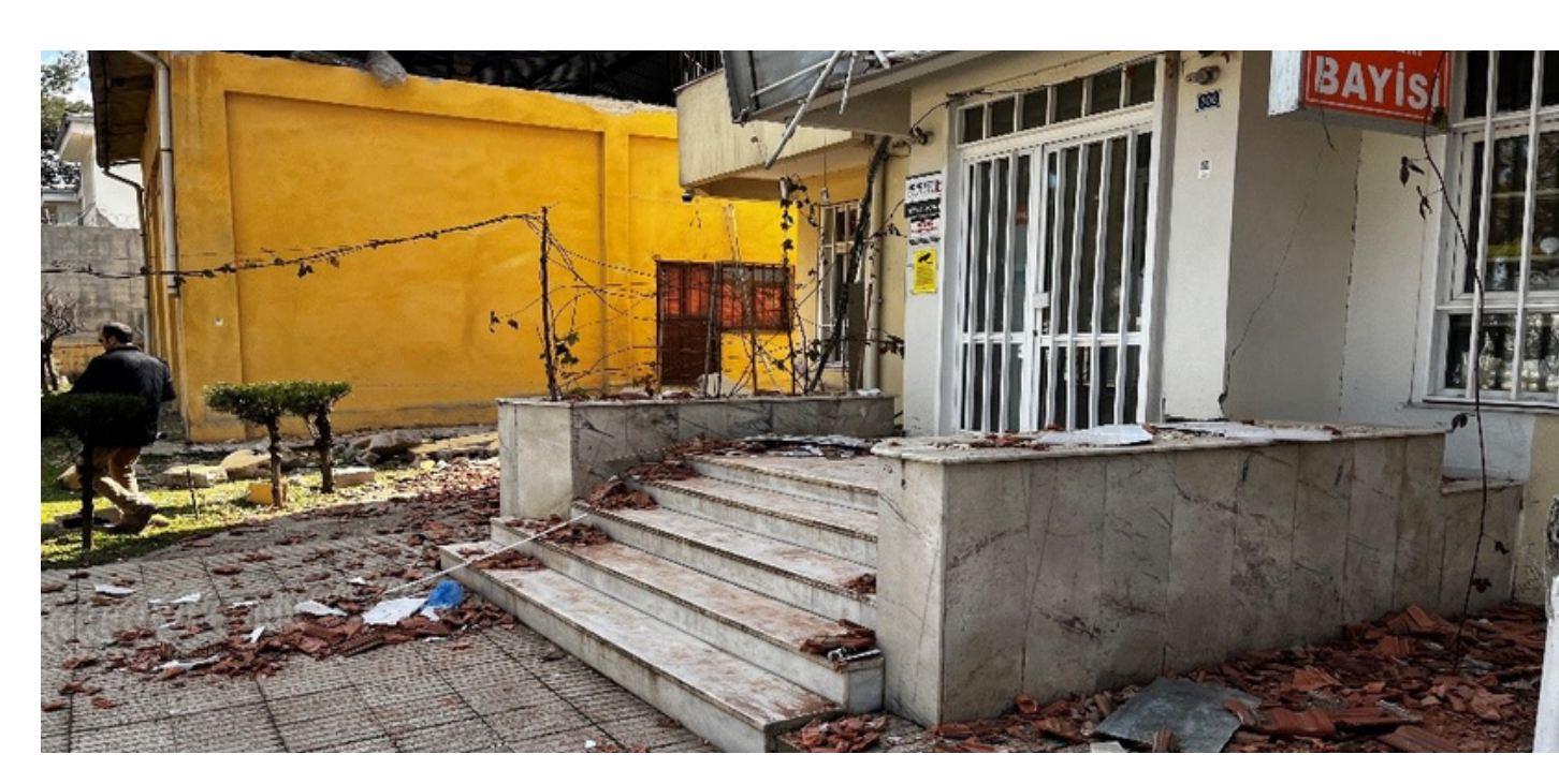
A Turkish financial cooperative, left devestated after the February 2023 earthquake.

Our efforts help the global credit union system stay resilient and millions of members get back on their feet.